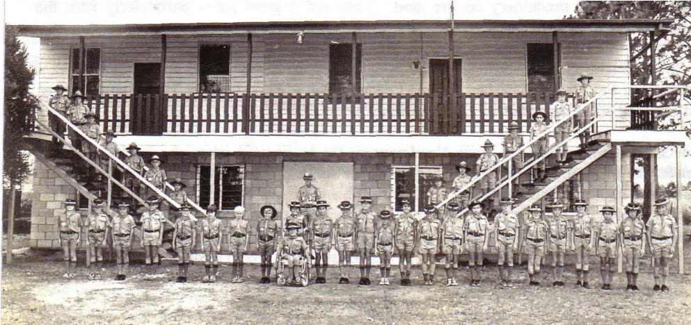
This Photo was taken in early 1980.

During December, 1979, work commenced on raising the Den to double its size again.