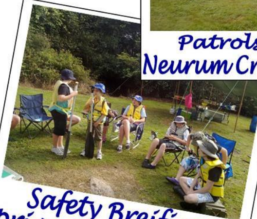
Safety Breifing prior to canoeing