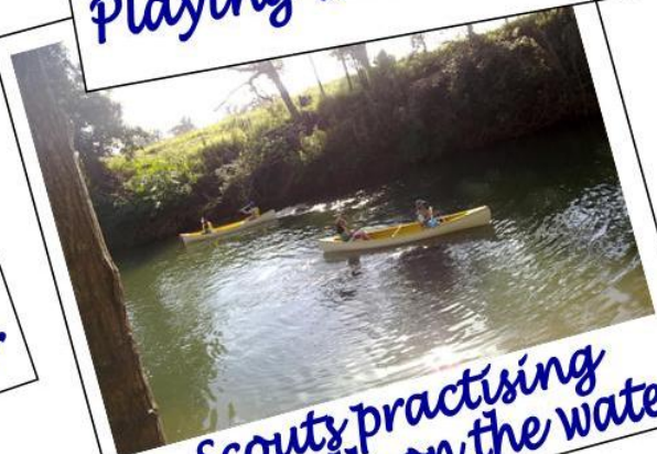
Scouts practising their skills on the water