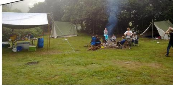
Patrols Campsite at Neurum Creek Bush Retreat