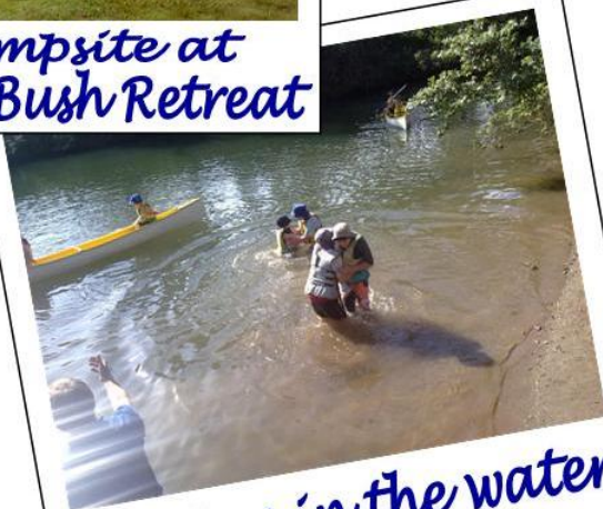
Playing in the water