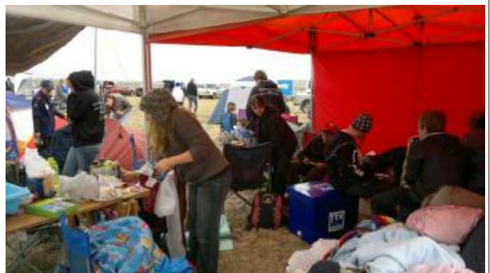
Our camp site with Oyster Point, Albany Creek and Dayboro Venturers at Night Hawk.

This term has been busy and it's still not over yet. We look forward to the activities to come.