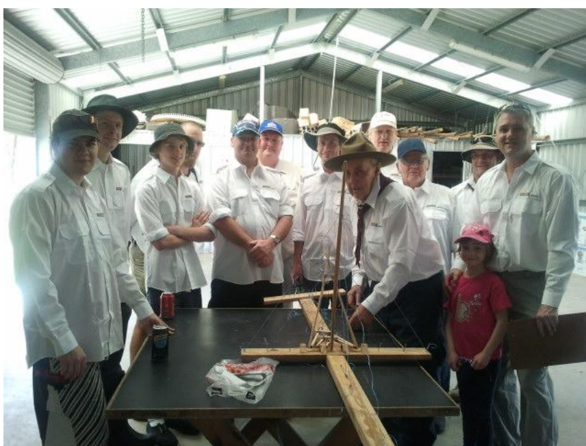
Leaders from D'Aguiar Range, Murrumba and Redcliffe Districts

They managed to get it up to the first set of sheer legs, but the second set finally broke under the strain. Wonder if they will try again??